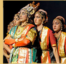
Shakti Dance Company