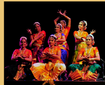
Padmasri Dance Academy : 2011 Chitram

Opportunities for members of the large and growing community of people of Indian heritage to come together to promote and express their cultural heritage.